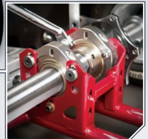
40mm axle supported by three bearings