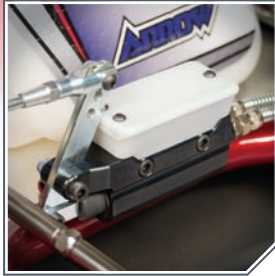
Machined billet alloy brake master cylinder anodised black