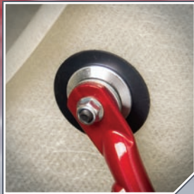
Arrow's unique self-centering seat washers