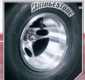
Arrow silver/black one-piece machined alloy 3-spoke wheels