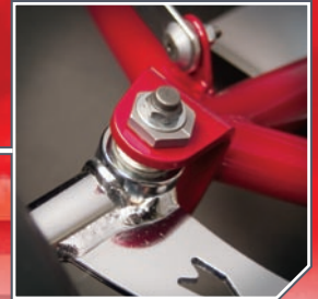
Adjustable camber/caster and front ride height