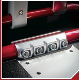
Arrow's unique adjustable front chassis clamp