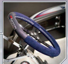
Arrow embroidered flat top suede steering wheel with 'carbon-fibre-look' top