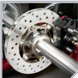
Machined billet alloy 2-spot brake caliper anodised black