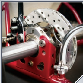
Adjustable rear ride height